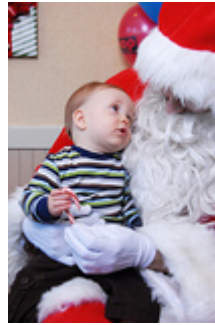
Breakfast With Santa at the Keyport IHOP!

3 Chicks That Click Photography concluded a successful "Breakfast With Santa" photo opportunity at the Keyport IHOP in December. 10% of the proceeds were donated to the FoodBank of Monmouth and Ocean Counties.