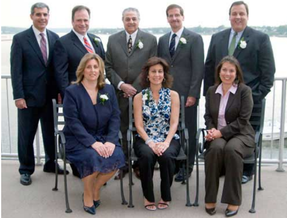
Crystal Beacon Awards 2008 - Honoring Special Companies and Individuals Thank you to all those who made this year's event a huge success!